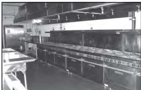
Ovens and Stoves, Kitchen