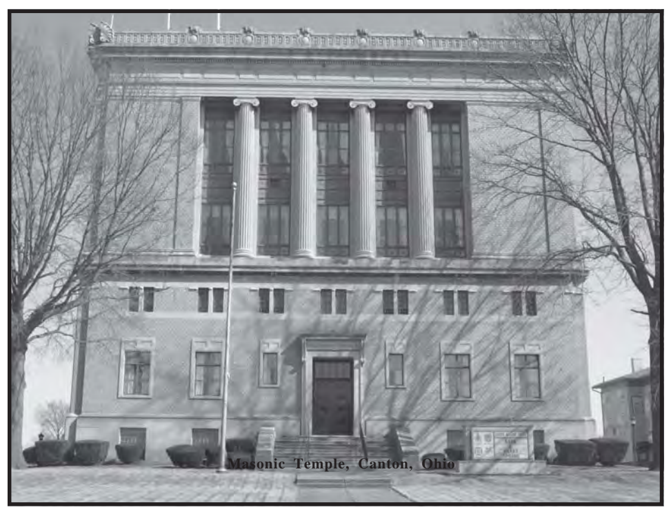
Masonic Temple, Canton, Ohio

Brethren, our drive to save the temple is under way and I am proud to say many have answered the call. Please look over the list below and give a hardy thank you to these brethren who are saying; "our temple is a treasure our future generations deserve to enjoy as we have."