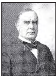
Made a mason in Winchester Hiram Lodge # 21 May 3rd 1865

In Honor of our Brother & President William McKinley, Jr