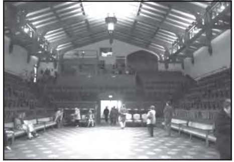
Cathedral Room Floor