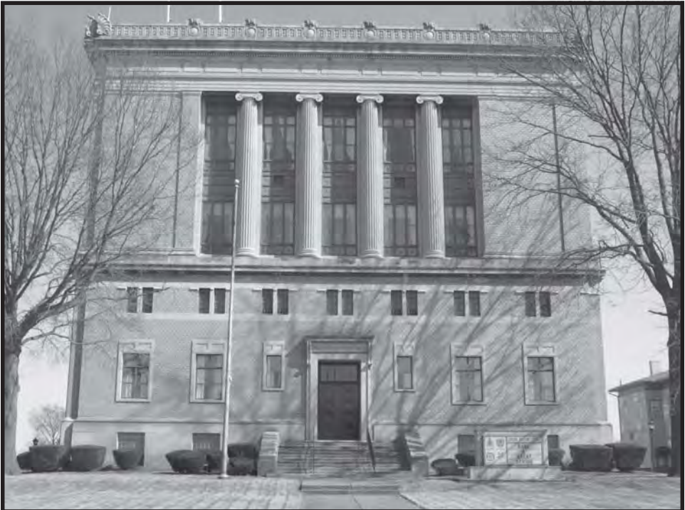
Masonic Temple South East Corner of North Market Ave. and Ninth Street N. E. See Page 12.