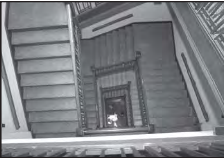
Main Stair Well