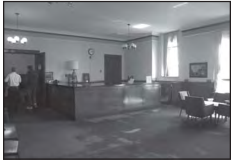
A.A.S.R. Anti Room