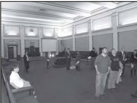
Blue Lodge Room

Following are a number of pictures showing several rooms you may recognize and have visited in the past. These architecturally beautiful areas will be gone forever if the Temple is lost.