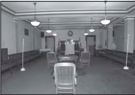
Auxiliary Blue Lodge