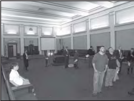
Blue Lodge Room