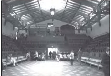
Cathedral Room Floor