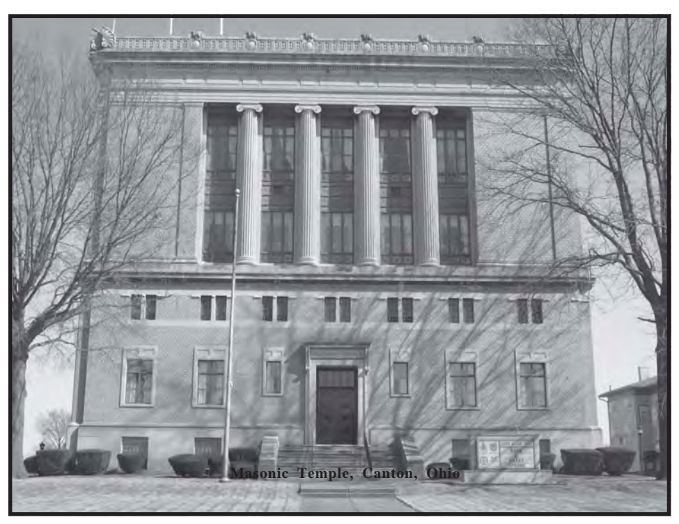
Masonic Temple, Canton, Ohio