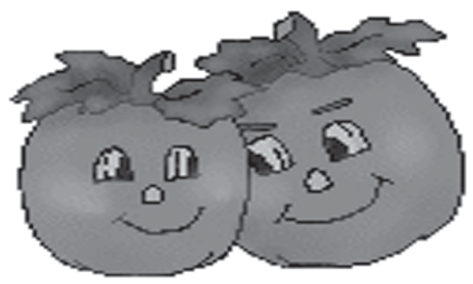
Wednesday, October 31, 2012 Halloween

Wednesday, October 24, 2012 United Nations Day