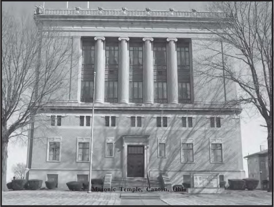
Masonic Temple, Canton, Ohio