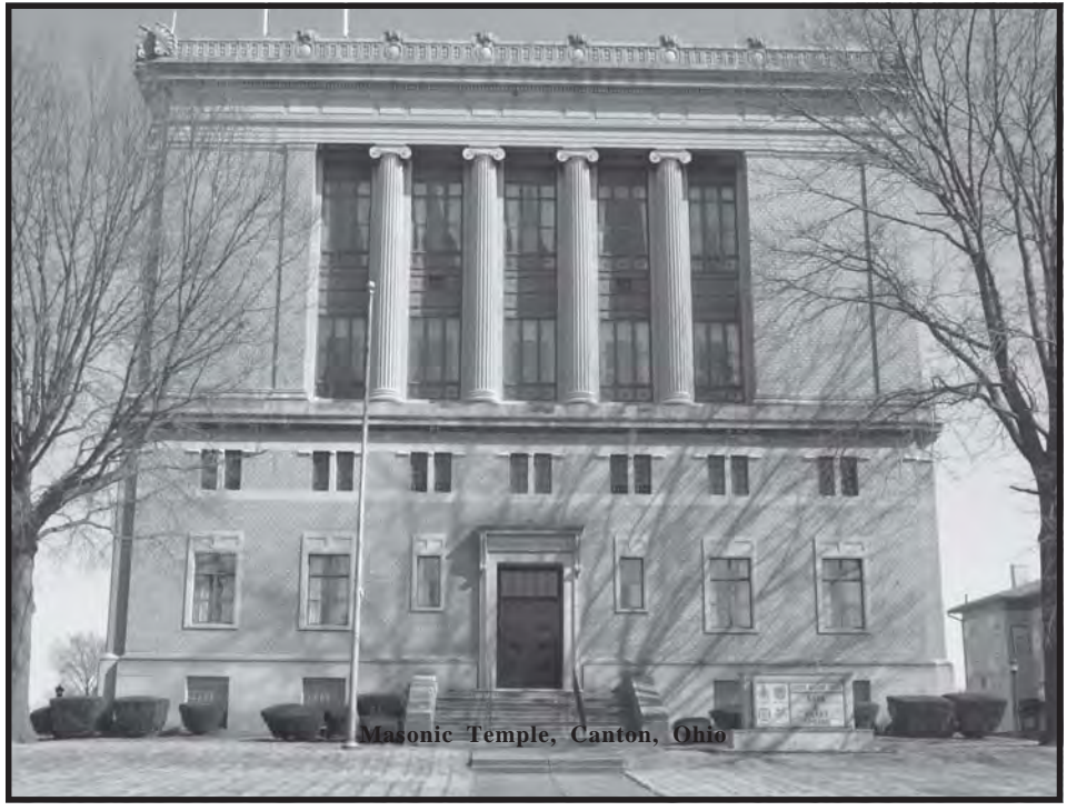
Masonic Temple, Canton, Ohio