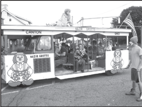
Tommy the Trolley and the Grotto Gang