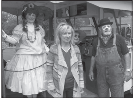
In Costume on Line and Ready to Go