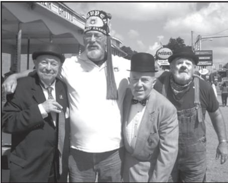
Hey! You Guys Standing in a Hole?