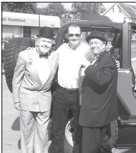
Look-A-Likes at H.O.F.