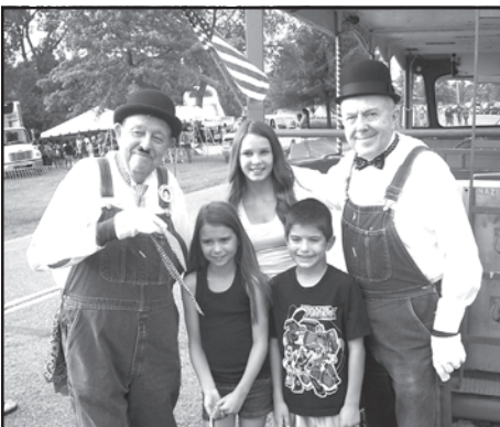
Look-A-Likes and Kids